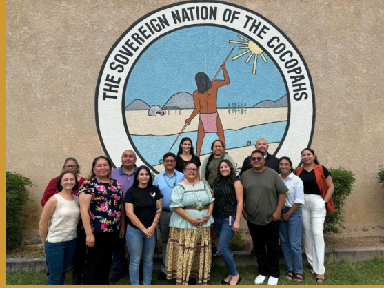
Quarterly Meeting at Cocopah Tribe