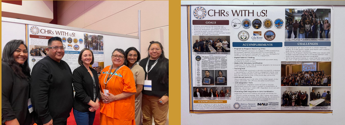
Members of the CDC-CCR Grant Cohort and the poster presented on the CHRs WITH uS! achievements thus far at the Sustainability Summit.