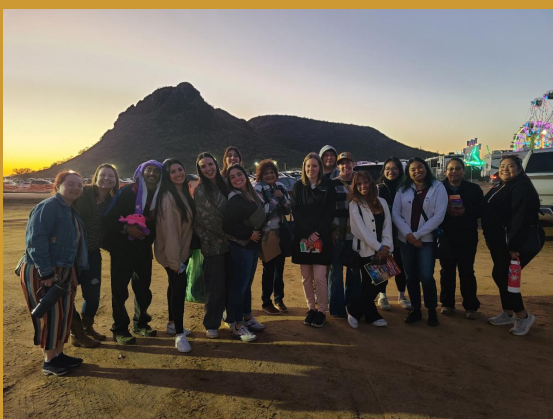
A group photo from the AIH-AHEC Scholars Program kickoff weekend. The group attended the 85th Annual Tohono O'odham Rodeo and Fair