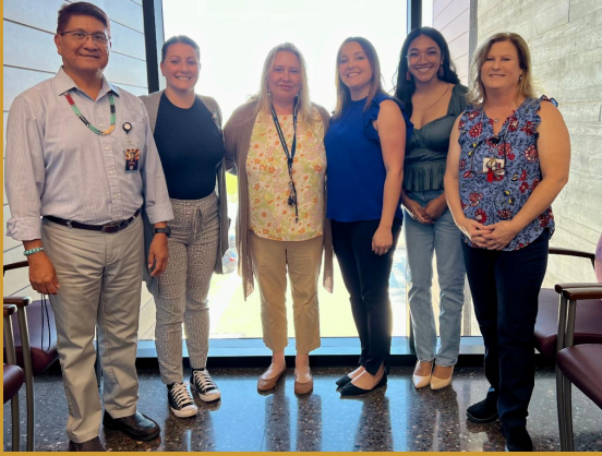
Site Visit to Salt River Pima-Maricopa Indian Community