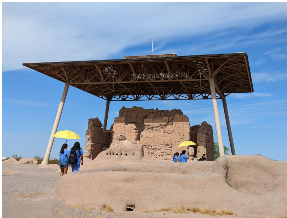
UA Med-Start Program & Gila River Summer Scrubs Program visit the Casa Grande Ruins National Monument